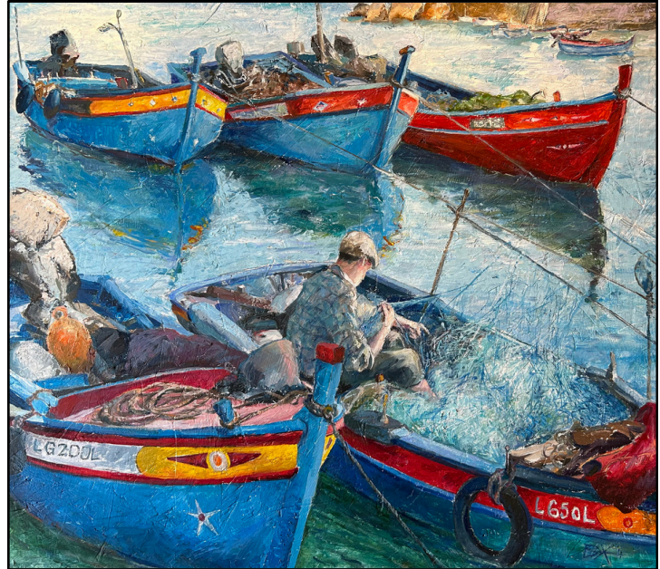
'Being prepared'. The harbour at Sagres in Portugal.

Forget the former things; do not dwell on the past. See, I am doing a new thing! Now it springs up; do you not perceive it? Isaiah 43:19